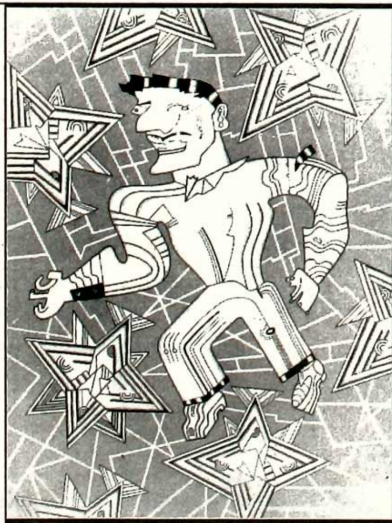
Karl Wrenn, Redmond Mizner Star Grazing, colored pencil on paper, 60" x 30", 1989. Courtesy of Paythe End Gallery. Photo by William Langston.